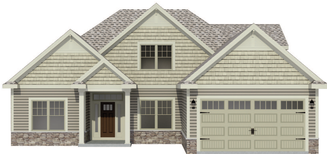
#2 --- UPGRADED EXTERIOR