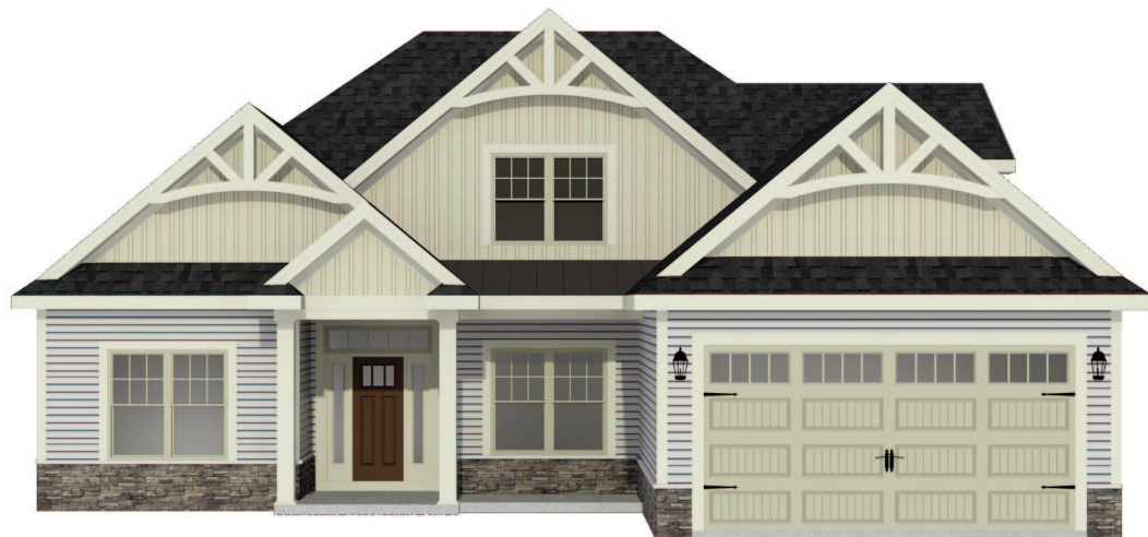
#3 --- UPGRADED EXTERIOR