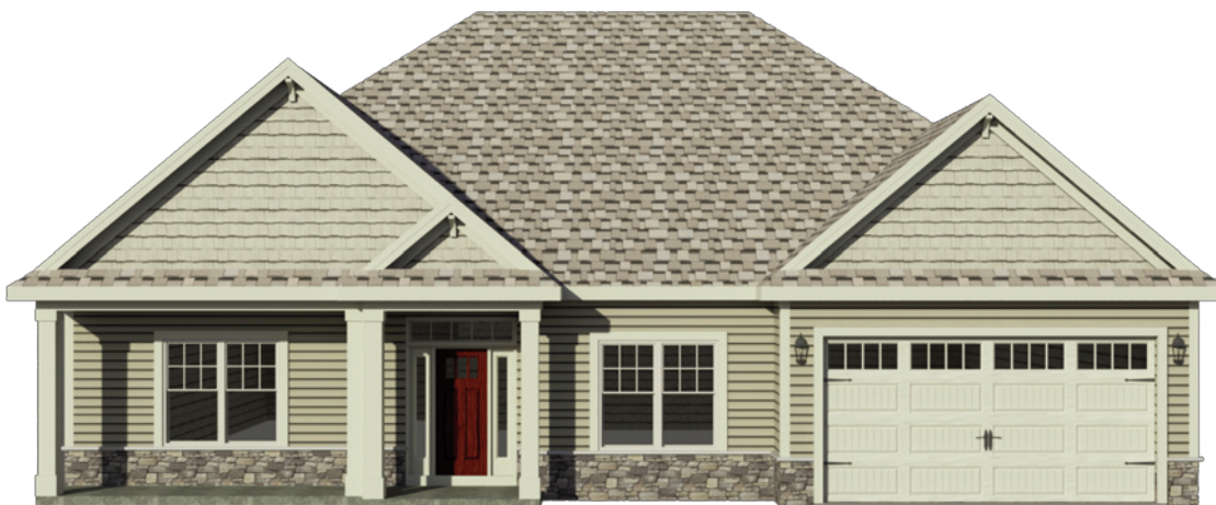
#3 --- UPGRADED EXTERIOR