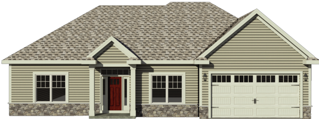
#1 --- STANDARD EXTERIOR